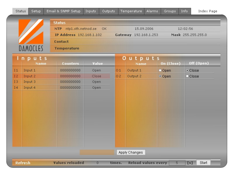
WWW interface - FLASH Setup